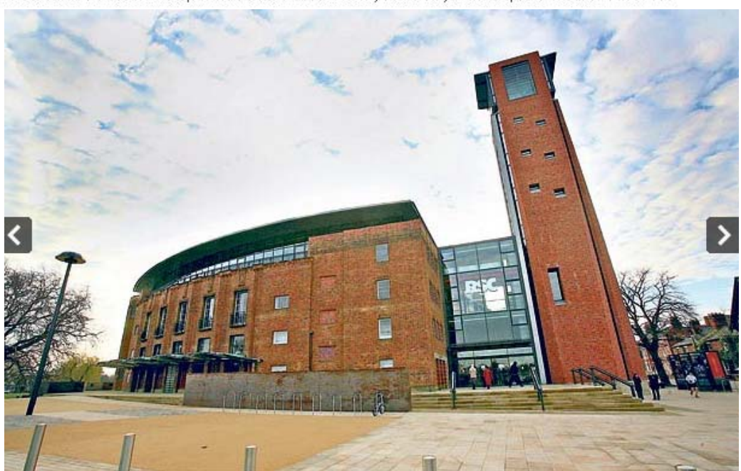
nage 4 of 5 triumph: the newly designed Royal Shakespeare Theatre