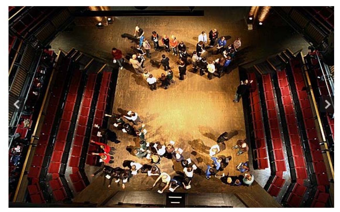
Image 3 of 5 Pupils conduct a Hamlet workshop in the auditorium of the newly rebuilt Royal Shakespeare Theatre